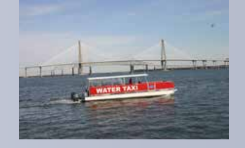
The Water Taxi leaves from the Marina from 9am - 7pm daily. $8 each way or $12 for an all day pass.(Kids 3 & under ride free.)

The Charleston Water Taxi links Charleston Harbor Resort & Marina to historic downtown Charleston.