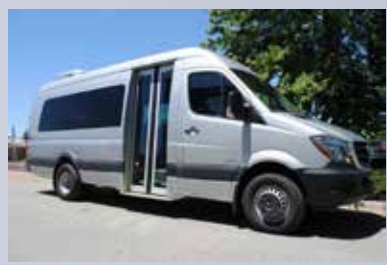
The drop off and pick up point is on North Market Street in front of the Key West Hats Co.