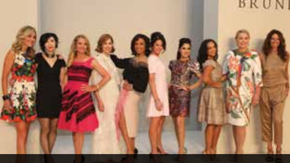
132. HOUSTON, 2017 March Of Dimes Best Dressed Honorees