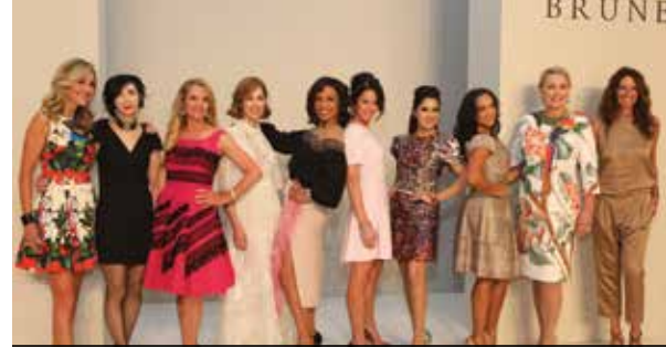
132. HOUSTON, 2017 March Of Dimes Best Dressed Honorees