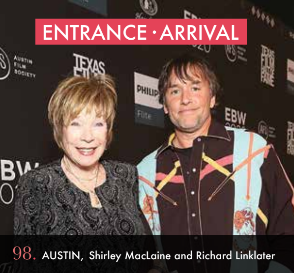
98. AUSTIN, Shirley MacLaine and Richard Linklater