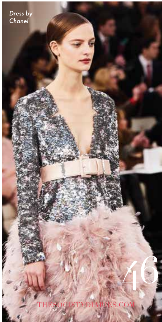
Dress by Chanel